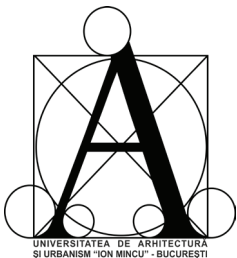
UNIVERSITATEA DE ARHITECTURA SI URBANISM "ION MINCU" - BUCURESTI

Ion Mincu University of Architecture and Urbanism, Romania